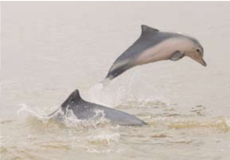
Leaping dolphin

spy-hopping. When they display this behaviour they are often in large groups together. When observing this behavior, the boat is brought to a stop and the motor is shut down; and we leave it up to the dolphins how they communicate with the human guests.