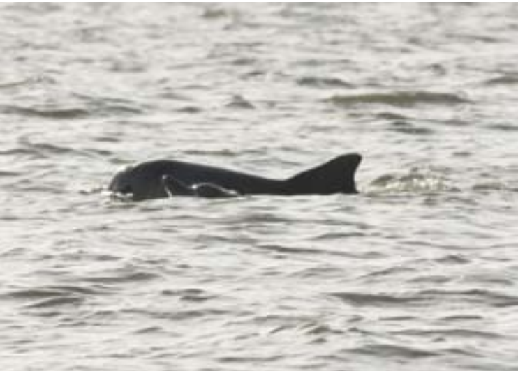
Baby dolphin with mother