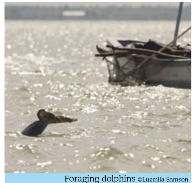
Foraging dolphins

The food of the profosu consists mainly of fish and shrimp. The animals are masters in catching these. Sometimes you can see how the animals throw a fish in the air and then eat it. When feeding we often see that they put their tails right up in the air, which is called a tail flip. When observing the typical behavior of dolphins foraging remain at a distance, and admire their speed, strength and agility. After all, we would not enjoy if someone came speeding straight through our picknick.