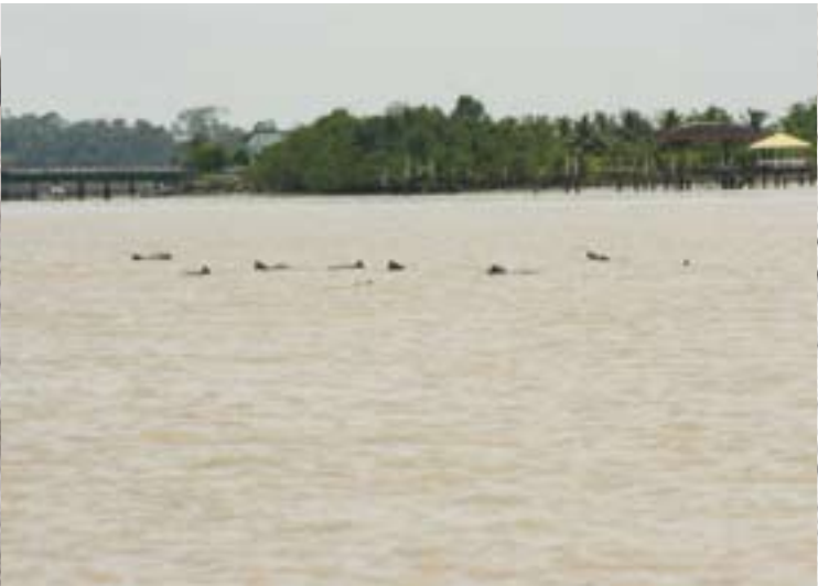
Large formation of dolphins © Luzmila Samson