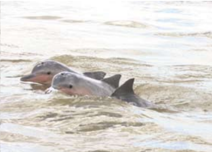
"Travelling" dolphins